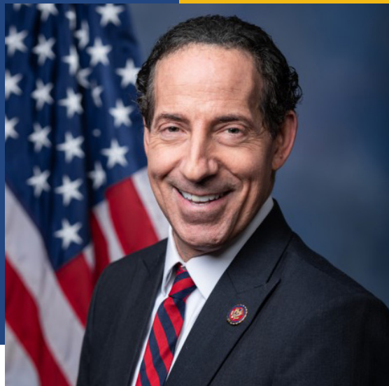
Representative Jamie Raskin

Judith Heumann Champion of Justice Awardee